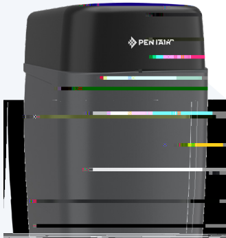
50-gallon atmospheric tank

*Not performance tested or certified by NSF.