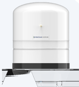
10-gallon hydropneumatic tank